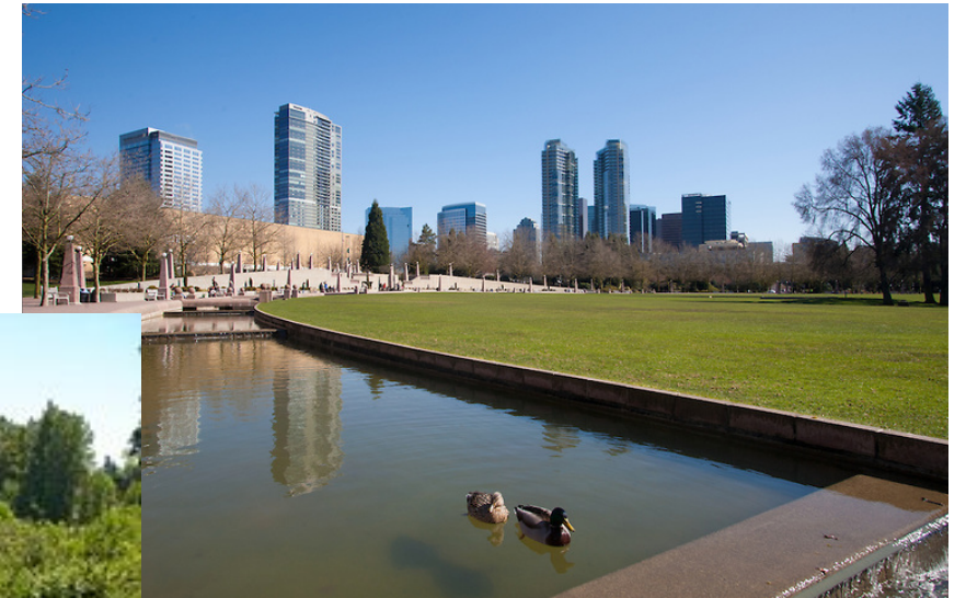
Bellevue's Downtown Park