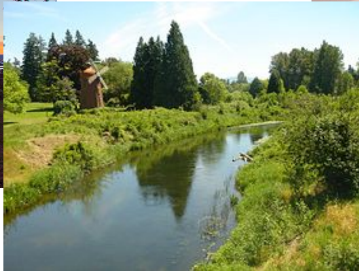
Redmond's Marymoor Park